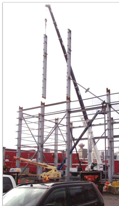
erecting 107 ft columns