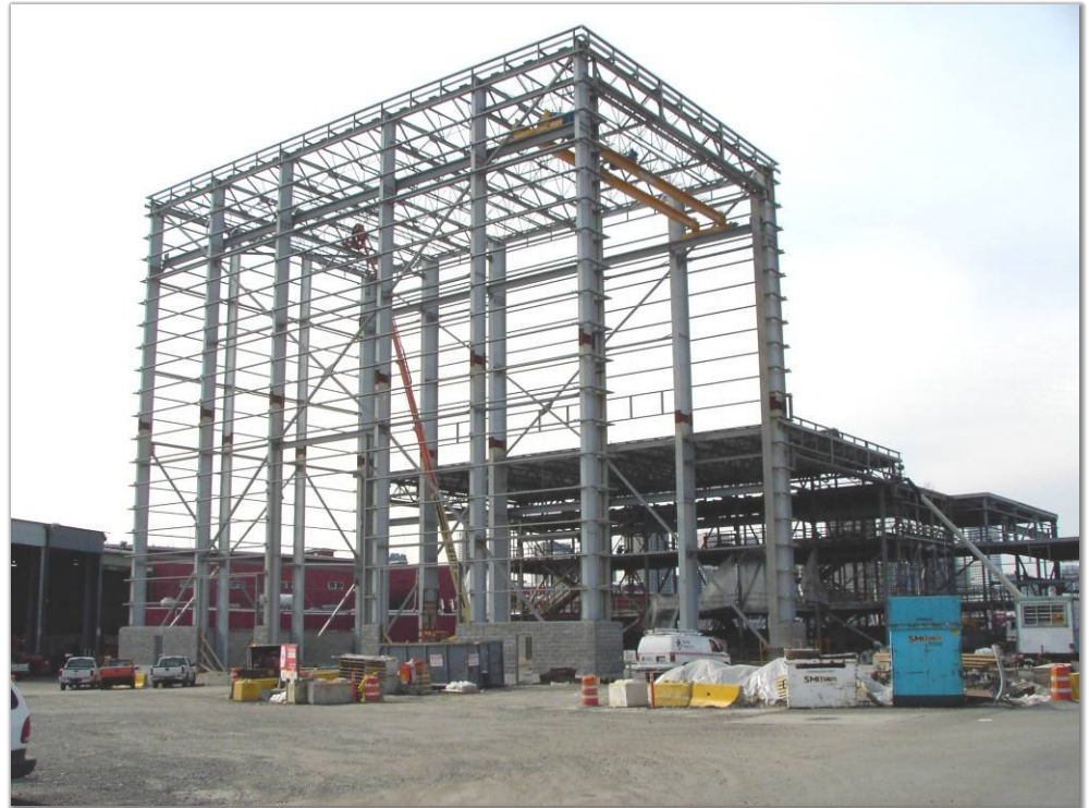
the servicing facility includes a 100 ft tall bay for servicing Centerm's new Rubber Tire Gantries (RTG's)

Other critical obstacles that were overcome were the instability of the 60ft roof trusses and low tolerances of the overhead crane rails and 100ft main door frame